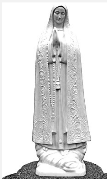
Mother of the Redeemer Farm

Our Lady: This is what God is doing, child. He is going to remove the messages, and try something more drastic, to get the attention of His children. God has a plan. His plan is perfect. There is to be great suffering come to your country as a result of the complacency of God's children to the evil going on around