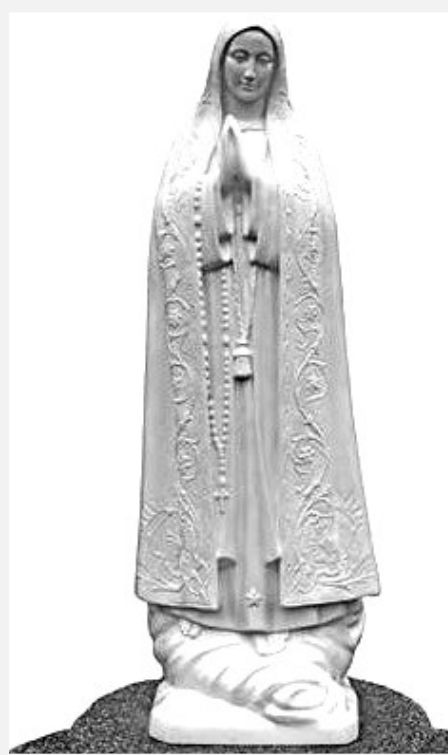
Mother of the Redeemer Farm

Jesus: Child, I am always here to listen. This is not just true for you, but for all My children. It is My children who must make time for Me. I am always ready to listen, as well as answer My children. They need only pray and listen. For some, this is extremely difficult. Most of My children are so caught up in the world around them, they have no quiet time. No quiet time to speak to Me, and no quiet time to listen. The more material things they accumulate in their lives to make living easier in this world, the more time they have to scurry around doing more things. Man in his desire to have life more convenient has nearly blocked out all quiet times he had in his life. Many of the hours he had working the land, or baking his daily bread, is now spent in pushing buttons and running here and there to take care of business. Many of the hours that he had spent in communion with God in nature, is spent on things of less importance. My children have nearly wiped Me from their lives completely. So much so, that many believe I do not exist. They actually feel I am not responsible for what goes on in their daily existence. They forget Who has put them here, and for what purpose.