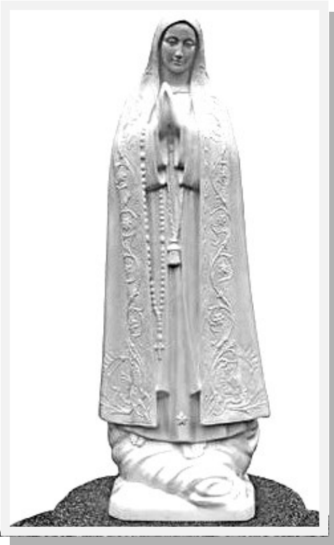
Mother of the Redeemer Farm

Jesus: Little one, it is not a strange statement. It is a statement concerning the state of your world. All around you, in other countries, you see devastation brought on by man's greed and lust