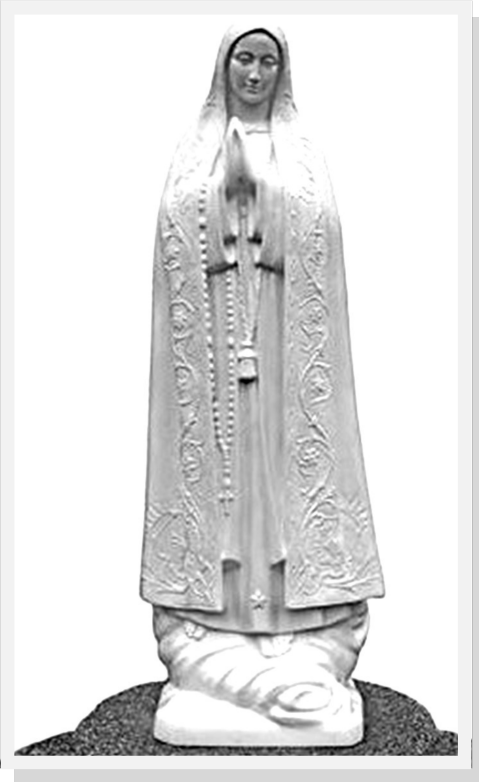
Mother of the Redeemer Farm

Jesus: Little one, it is. Remember, this is for all who come here. My Mother has been instrumental in bringing you and all these children who come here for special graces and prayer, and She must be acknowledged. It is as your talk was titled, 'To Jesus through Mary'. That, little one, was not of your doing, and neither is the statue, the prayer group, or all of the people whose life you touch. It is My doing. It is the doing of My Mother. She is being allowed to call Her children together as a mother hen would do to all her baby chicks in danger. She is calling them and putting them under Her wings. In that situation, however, it is Her protective mantle. Those who listen are special. Those who