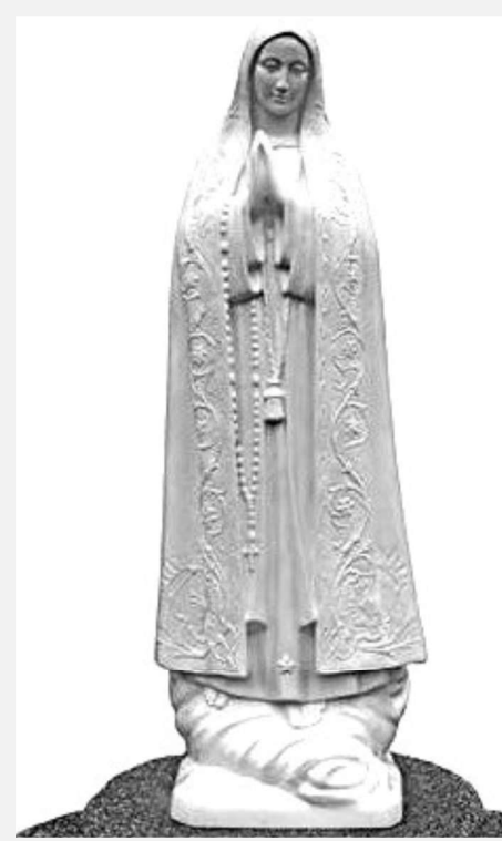
Mother of the Redeemer Farm

Jesus: Yes, child, I am telling you that works and prayers done out of love, and offered up for God to use for the benefit of saving souls, is something that merits much grace. These are called sacrifices. These are called penances. Words that you hear very little of today in this world. My children of today do not wish to give up or sacrifice